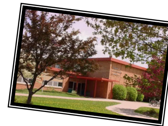
Thomas Jefferson Elementary School